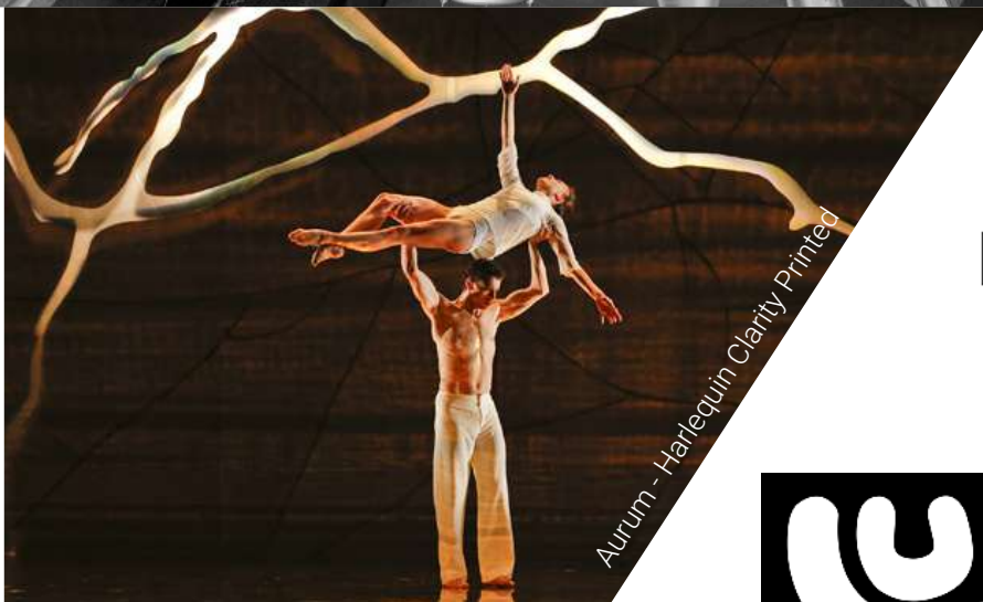
Aurum - Harlequin Clarity Printed