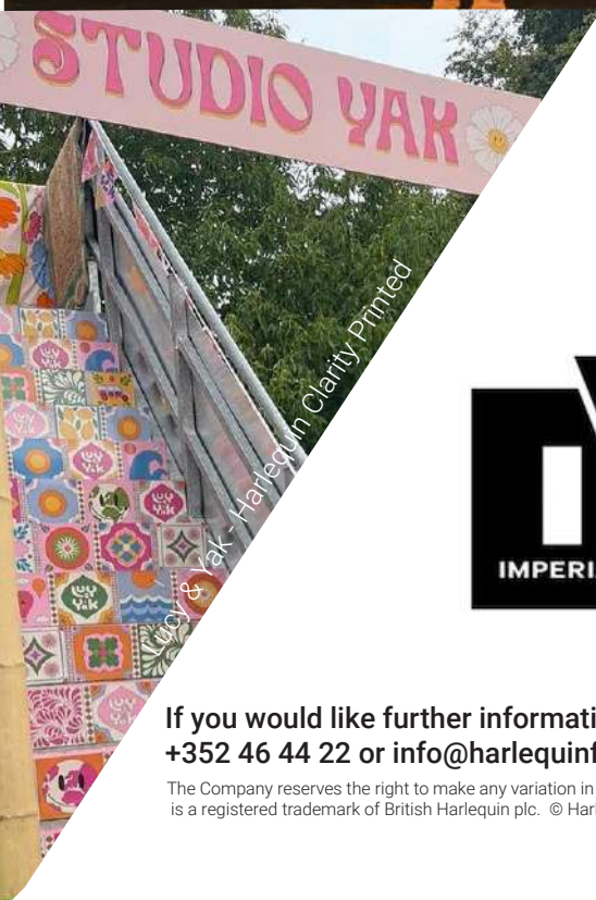
Studio Yak - Harlequin Clarity Printed