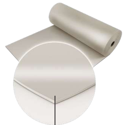
Homogeneous vinyl with support and a slip-resistant dance surface