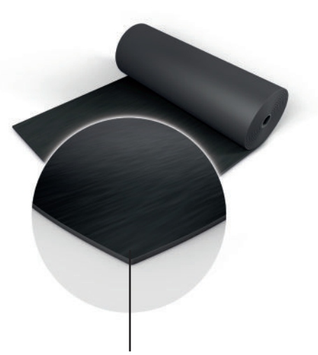
Homogeneous vinyl with a fire resistant performance surface, which conforms to International Marine Organization (IMO) standards