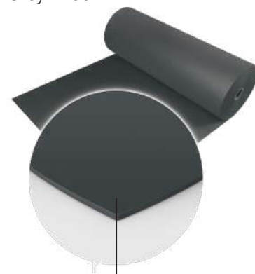
Homogeneous vinyl with a slip-resistant performance surface