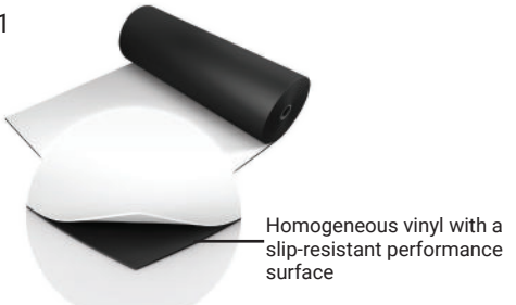
Dark Grey/Light Grey - 003